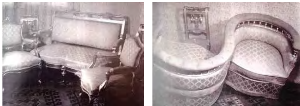
Figure 17. Villa Husedžinović; furniture in style of Louis XV, "pink saloon". [11:132]

Considering the fact that the house is neither under protection nor on any of the lists of protected heritage, it has preserved a satisfying amount of its original design. This, however, is not given in general, because current owners had done several add-ons and structural changes, mainly in garden sections, ruining some ideas of the original design.