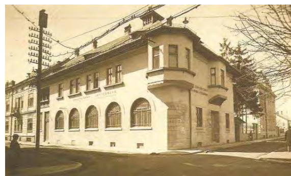
Figure 10. Landesbank branch; view of the northeastern corner [8:193]

After the earthquake in 1969, the building suffered significant damages and was torn down in 1970.