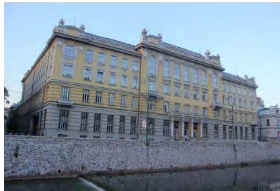
Figure 7. Main Post office in Sarajevo: designed 1907–1910, and built 1913 according to plans by Josip Vancaš: present condition (2013)

Vancaš deceased on 15th December 1932 in Zagreb.