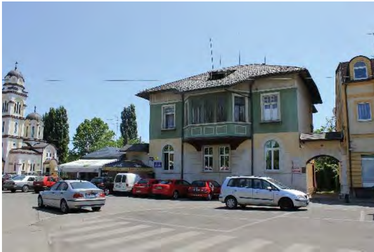
Figure 14. Villa Husedžinović. View of the northwestern façade; present condition.

Three materials are dominant: ground floor zone, along with entrance gateways is covered with stone blocks; first floor zone is plastered and painted in a combination of white and green colour. Other decorative elements are wooden.