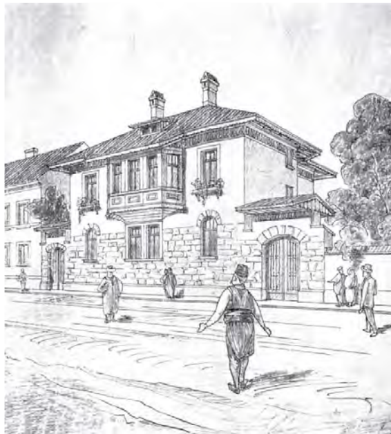
Figure 11. Villa Hušedžinović; the original sketch done by Josip Vančaš [9: table 25]

Villa for the mayor of Banja Luka, Hamidaga Hušedžinović, is in general one of the most important examples of the neo-traditional style, later named “Bosnian style” in architecture.