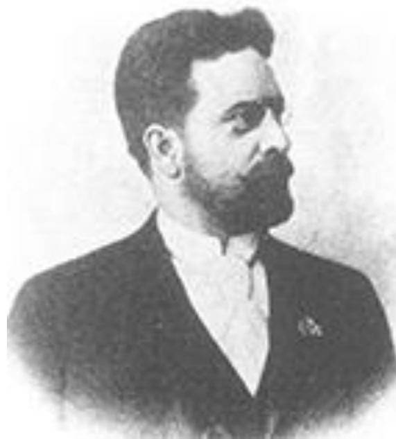
Figure 6. Josip Vancaš (1859–1932) [3:49]

called “Bosnian style”. Among all foreign architects that worked in Bosnia, and maybe until nowadays comparable to all contemporary ones, Vancaš left the biggest opus of works and ingenious amount of different approaches, designs and implemented ideas. Overall, Vancaš designed and built more than 240 buildings: 102 houses, 70 churches, 12 institutes and schools, 10 state and municipal buildings, 10 banks, 7 palaces, 6 hotels and coffee-shops, 6 factories, 7 interior designs and altars and 10 adaptations. [2:36]