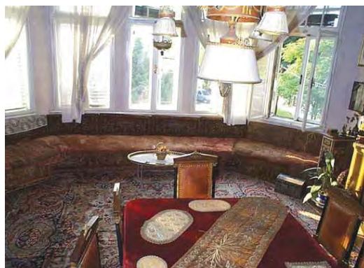
Figure 15. Villa Husedžinović; “divanhana” details [11, 10:130]

“Divanhana” is the only room that preserved its original interior design, which represents a unique connection between traditional elements and imported furniture directly from Vienna. The oldest part of the furniture is the standing clock with engraving in German: “Die