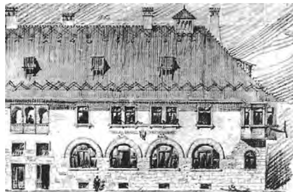
Figure 9. Landesbank branch; elevation view from the east. [5:267]

Landesbank branch was designed by Josip Vancaš in 1910 using the same language and methods that he also applied to many single-family houses. The bank in Banja Luka was one in the series of branches designed that year; the project comprises all the elements needed to understand the latest phase of Vancaš's design in the light of the new-coming "Bosnian style." [1:227–228]