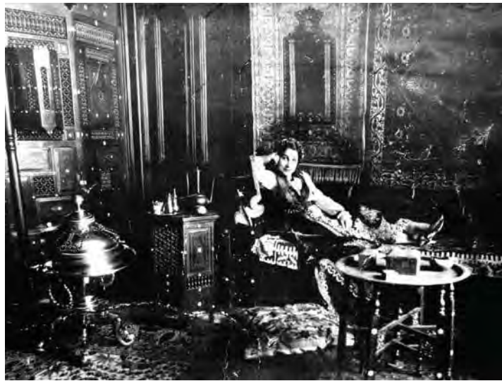
Figure 16. Villa Husedžinović; Arab room detail. [10:129]

Arab room is also interesting. It is, however, an unfortunate case because it was removed from the house; in 1958 it became a part of the permanent collection of the Museum of Bosnian Krajina, today the Museum of Republic of Srpska. Except for the traditional Bosnian rugs, originally named "čilim", everything was designed in Moorish and Persian style. The furniture is imported from Cairo and delivered via Vienna.