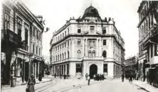
Figure 8. The Grand Hotel in Sarajevo: built 1892–1895, according to project done by Josip Vančaš and Karel Pařík [4:18.d]